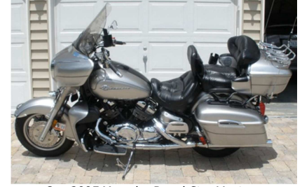
Our 2005 Yamaha Royal Star Venture

involved in another accident. The motorcycle was totaled but Bruce woke up in Fairfax hospital with a concussion and some road rash and no recollection of the incident (still true). Not easily dissuaded, he bought a touring bike a week later and did the same summer ride as in 2010 to visit relatives and friends in Indiana and Ohio but in more comfort.